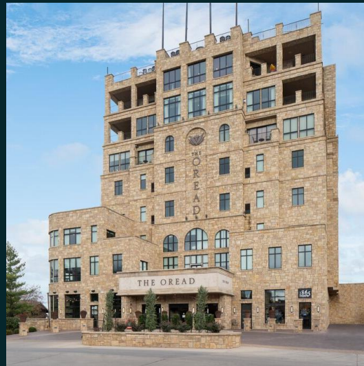
The Oread Lawrence Lawrence, KS

High quality, select service and extended stay hotels diversified by location, brand, and demand drivers.